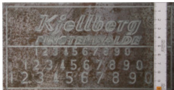
Cutting sample marked with PerCut 450M

The line width and the depth of the marking can be optimally adjusted to the cutting task by setting the current, marking speed and torch height. When punching, the penetration depth can also be changed.