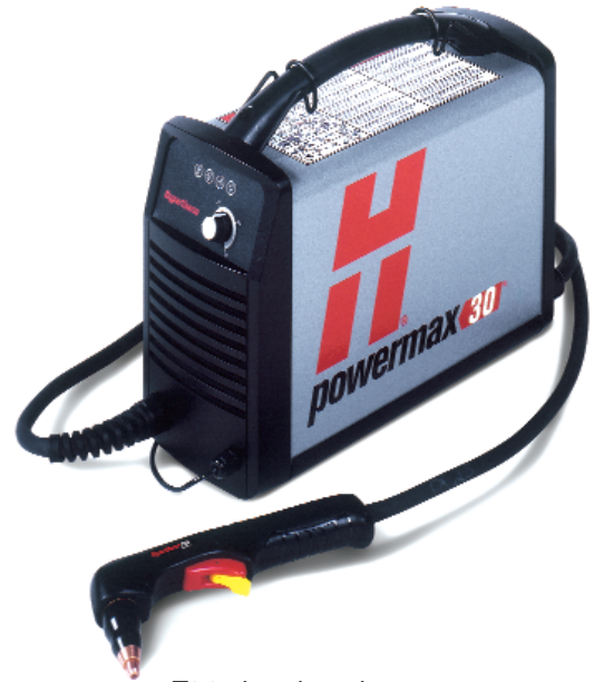
T30v hand torch